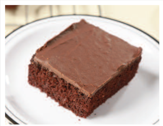
Wacky Chocolate Cake