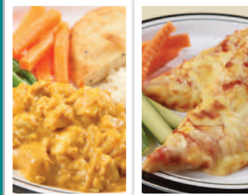
Chicken Korma served with Rice, Naan Bread & Seasonal Vegetables or Deep Pan Cheese & Tomato Pizza Slices served with Carrot & Cucumber Sticks