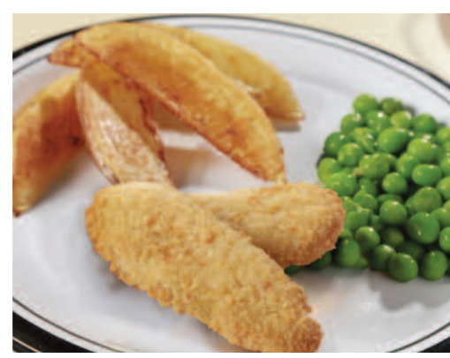
Breaded Chicken Goujons served with Potato Wedges & Seasonal Vegetables