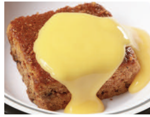
Sticky Toffee Pudding served with Custard