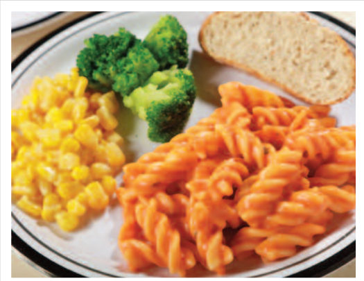
Tomato & Mascarpone Cheese Pasta served with Garlic & Herb Bread and Seasonal Vegetables