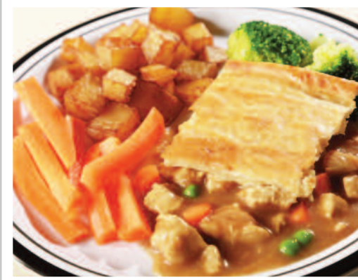
Homemade Chicken Pie served with Diced Crispy Potatoes & Seasonal Vegetables