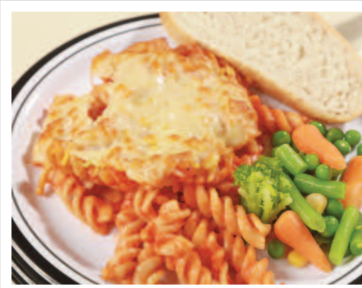
3 Cheese & Tomato Pasta served with Garlic & Herb Bread and Seasonal Vegetables