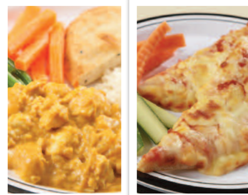
Chicken Korma served with Rice, Naan Bread & Seasonal Vegetables or Deep Pan Cheese & Tomato Pizza Slices served with Carrot & Cucumber Sticks