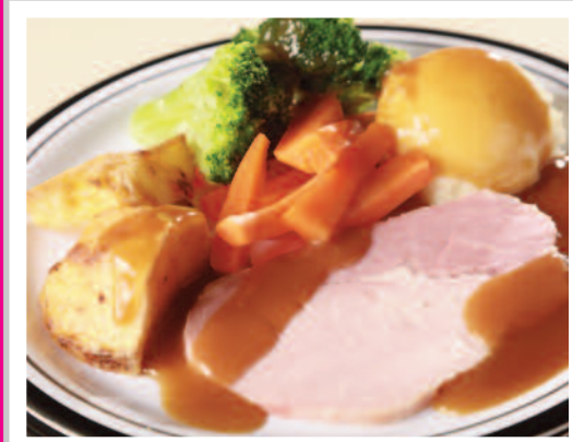
Honey Roast Gammon served with Roast/Mashed Potatoes, Seasonal Vegetables & Gravy