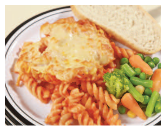
3 Cheese & Tomato Pasta served with Garlic & Herb Bread and Seasonal Vegetables