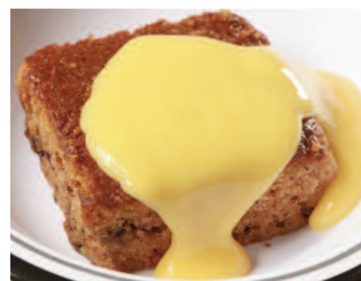
Sticky Toffee Pudding served with Custard