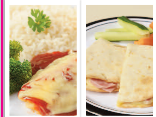
BBQ Chicken served with Savoury Rice and Seasonal Vegetables or or Hot Cheese & Ham Wrap served with Carrot & Cucumber Sticks