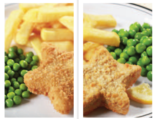
Salmon/Cod Fish Star (MSC) served with Chips & Peas or Baked Beans