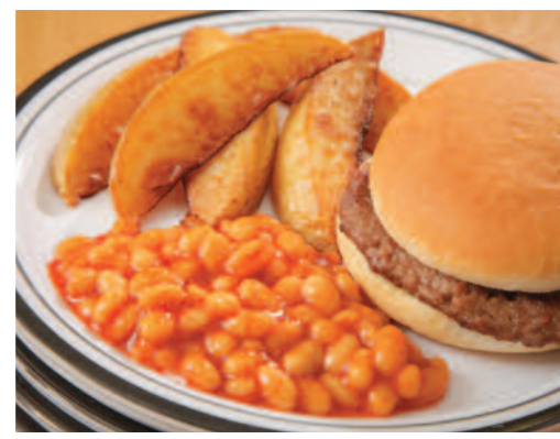
Beef Burger served in a Bun with Potato Wedges & Seasonal Vegetables or Baked Beans