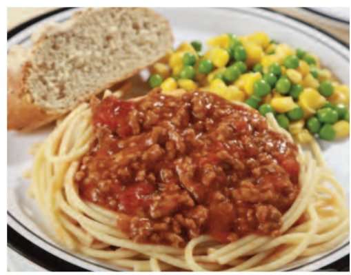
Spaghetti Bolognese served with Garlic & Herb Bread and Seasonal Vegetables