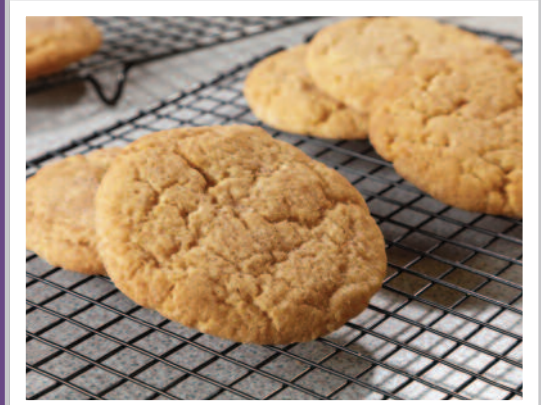
Snicker Doodle Biscuit

AVAILABLE DAILY – UNLIMITED SALAD, FRESHLY BAKED BREAD, FRUIT YOGHURT, FRESH FRUIT PLATTER & CHILLED WATER. FOR ALLERGEN INFORMATION, PLEASE ASK ONE OF OUR CATERING TEAM. ALL THE ABOVE DISHES ARE SUBJECT TO AVAILABILITY.