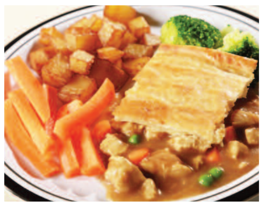
Homemade Chicken Pie served with Diced Crispy Potatoes & Seasonal Vegetables