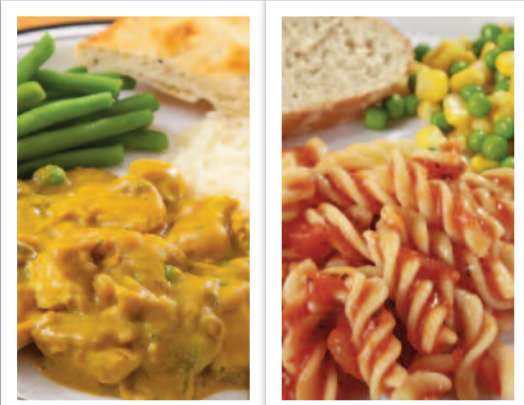
Chinese Chicken Curry served with Rice, Naan Bread & Seasonal Vegetable or Tomato & Basil Pasta served with Garlic & Herb Bread and Seasonal Vegetables