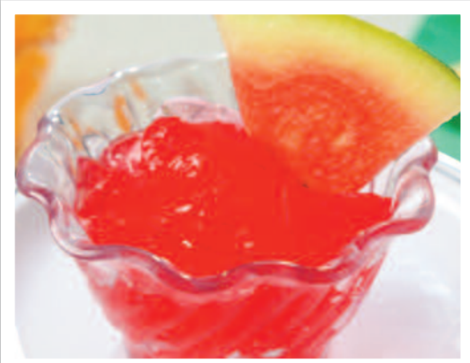
Jelly & Fruit