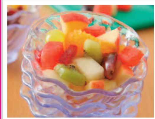
Fresh Fruit Salad