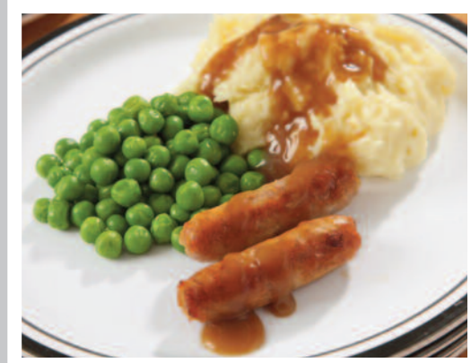
Sausages served with Mashed Potato, Seasonal Vegetables & Gravy